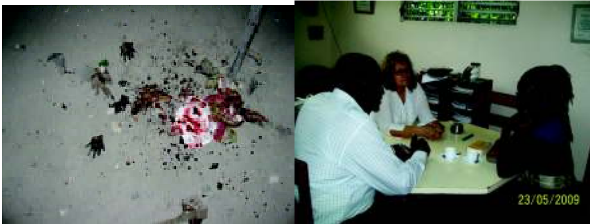
Working with the Mayor of Anse-a-Pitres to outlaw iguana hunting in the Municipality