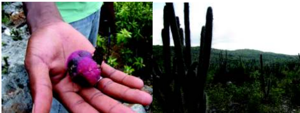
Fruit from a large cactus in Savann Laflè (left) and a view of the habitat (right)

In April, we conducted a field expedition to Savann Laflè (Savanne La Fleur in French), a fondo ~3.5km northwest of the La Saline nesting site and falls within the municipality of Anse-a-Pitres. The soil in this large fondo in Savann Laflè was very much like that of the Ricords habitat in Pedernales, D.R., with red clay-like soil, and the vegetation was also very similar. During this time many species of cacti were producing large fruit abundantly, which likely sustains iguanas well. An adult iguana was found dead in a trap during this trip. All that remained of the decayed carcass was the skeleton some desiccated muscle, and very small amount of truncal skin. The iguana was assumed to be a Ricord by the absence of a protuberance, or ‘horn’, over the nose. We also found evidence of previous years' iguana nests in a large plain surrounded by high lime-rock hills. However, it was not certain if these were Ricords nests or those of Rhinoceros iguanas ( Cyclura cornuta ), and they did not appear to be nests from this year. With the unusual, daily heavy rains in this semi-arid region from May to September this year, it was difficult to coordinate a second excursion to search for Ricord’s nests in Savann Laflè, or to verify emergence holes for any of the nests that we identified. More investigation will be necessary during the following next year to confirm the presence of Ricord’s iguanas in Savann Laflè.