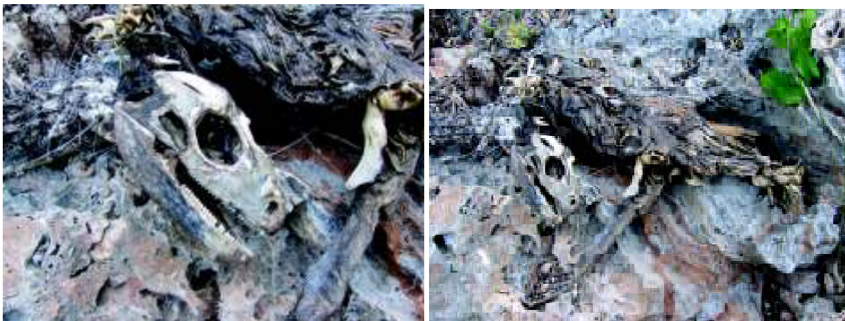
Iguana found dead in a trap in Savann Laflè, Anse-a-Pitres, Haiti

A surveillance team consisting of field assistants and members of the local youth groups OJAA and KOSRA Jenès was put in place since January of this year to regularly patrol the nesting site and surrounding habitat for traps, nest poaching, and tree-cutting. The group engaged in this activity several days weekly, and team increased vigilance by patrolling daily from March to August. Unfortunately nest poaching was not completely prevented, though other activities such as tree-cutting for charcoal production was significantly reduced, according to local herdsmen whose cattle graze in the region. I even suspect that a disgruntled member of the team, Nelson Jean, may have been sabotaging the work during a period when he was excluded from the monitoring program because of some infractions on his part. The surveillance team participants intervene regularly when people are found cutting trees, and when boys are found hunting wildlife. While local groups are able to provide some measure of protection the habitat, and deterred human invasion to some degree, the help local government of Anse-a-Pitres will be needed to fortify the conservation initiative.