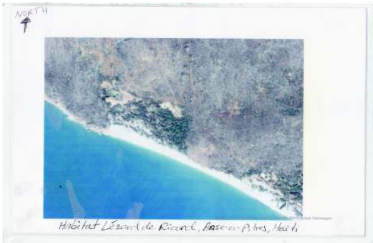
Satellite image of the La Saline C. ricordi habitat in Anse-a-Pitres, Haiti

X1 = X2 or 193m = \frac{5.2cm}{Y1} Y1=11,505cm or 115meters Y1 \quad Y2 \quad Y1 \quad 3.1cm 193m \times 115m = 22,195m^2 or 16.4 acres