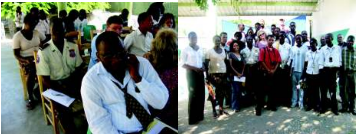
Local authorities of Anse-a-Pitres & Grupo Jaragua staff at the Municipal Protected Habitat workshop