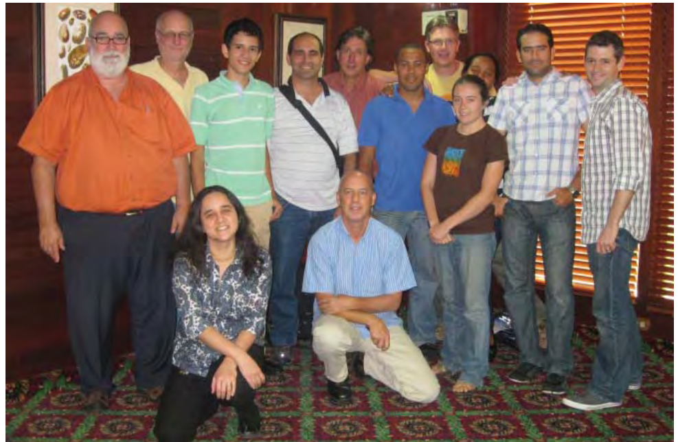
Participants at the joint Amphibian Red List and Conservation Needs Assessment workshop, covering species from Haiti, Dominican Republic and Jamaica.

One hundred and seventy-eight amphibian species were assessed for their conservation needs of which, 54 species occur in Haiti, 44 in the Dominican Republic, 24 in Jamaica, 62 in Cuba, 22 species in Puerto Rico and 6 from the Lesser Antilles. The assessment process resulted in the following recommendations: 25 species in need of ex situ Rescue programs; 112 species could still be saved in the wild with in situ conservation action; 41 species require further in situ research to determine more about the species population status and/or the threats they face; 78 species are currently undergoing, or are proposed for specific ex situ research that contributes to the