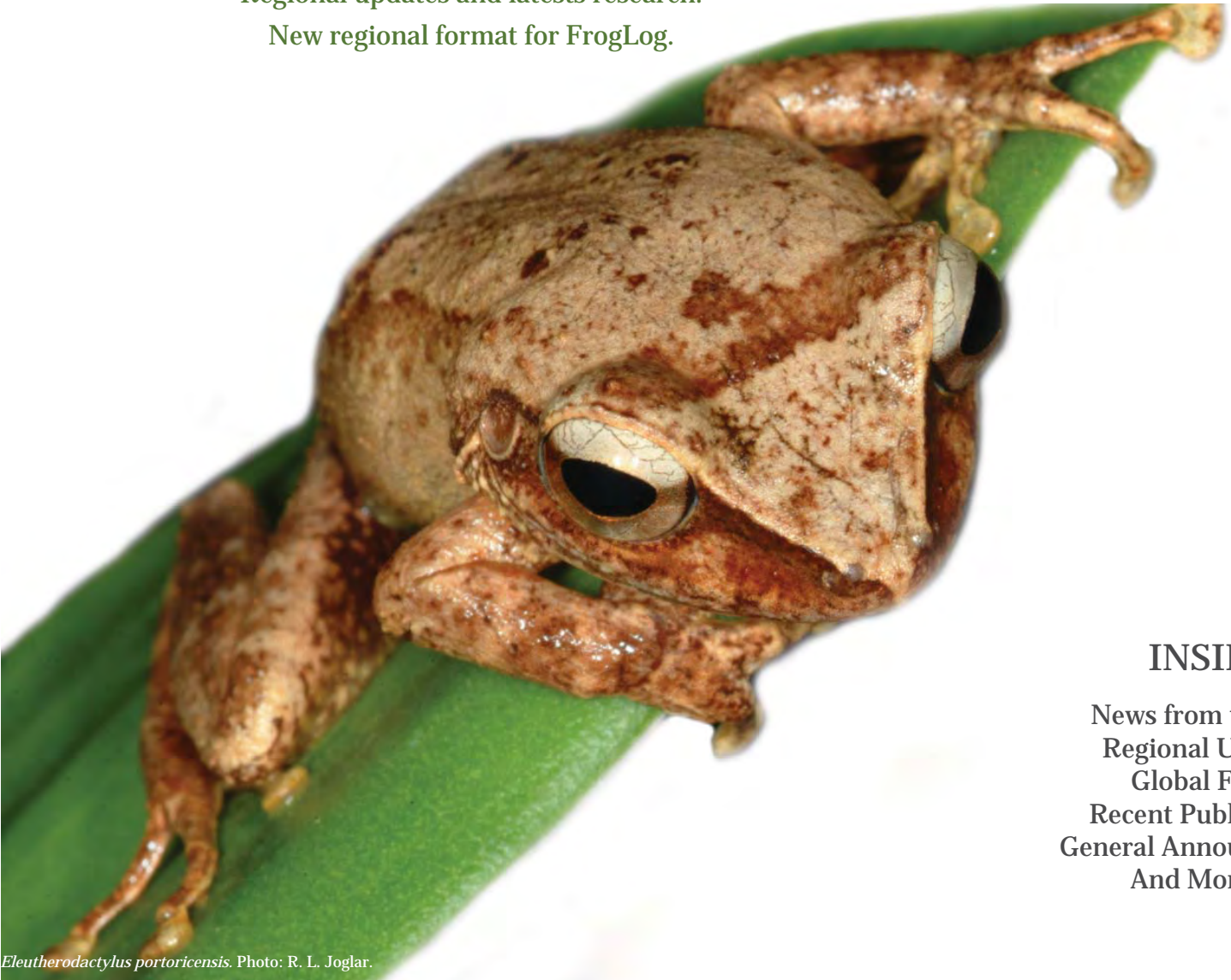
Eleutherodactylus portoricensis.

North and Central America and the Caribbean Edition Regional updates and latests research. New regional format for FrogLog.