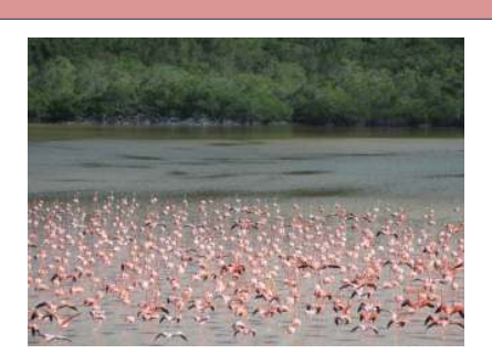
Figure 2. View of a Caribbean Flamingo flock near the nesting site, in the Bucan de Base wetlands of Jaragua National Park, Dominican Republic.  (February 2010).