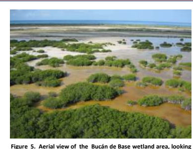
Figure 5. Aerial view of the Bucan de Base wetland area, looking towards the east (Beata Channel in the horizon)